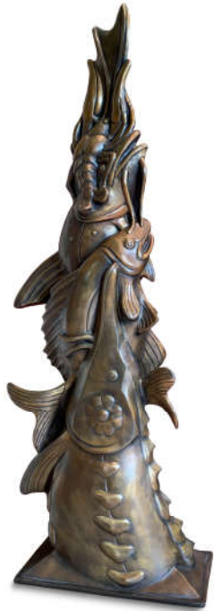
Slough Fish Finial by Wayne Chabre, located across from the Longview Police Station