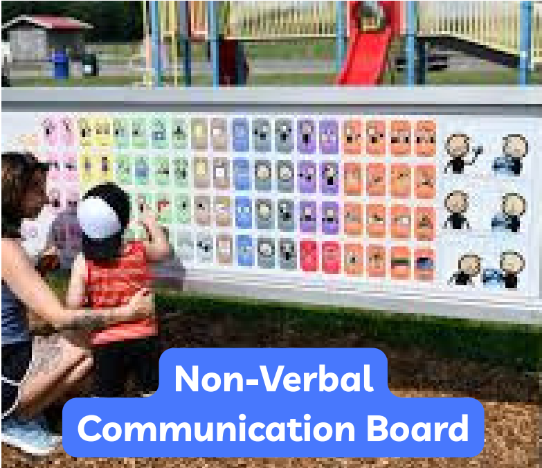
Non-Verbal Communication Board