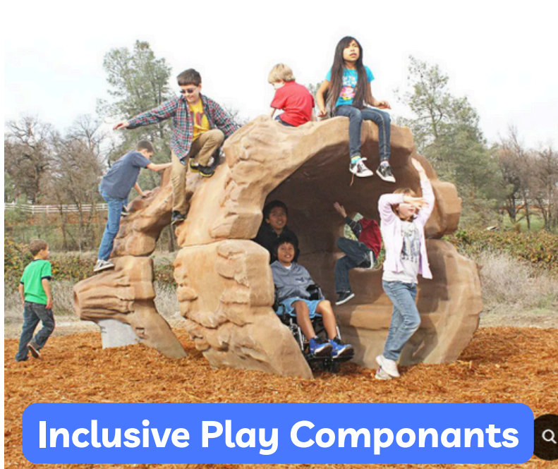
Inclusive Play Components