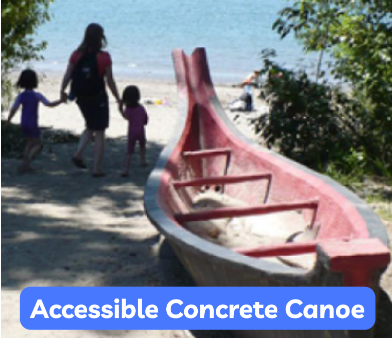
Accessible Concrete Canoe