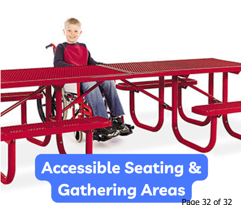
Accessible Seating & Gathering Areas