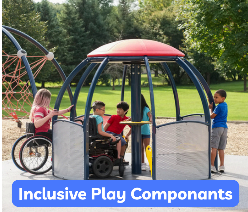
Inclusive Play Components