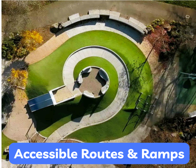
Accessible Routes & Ramps