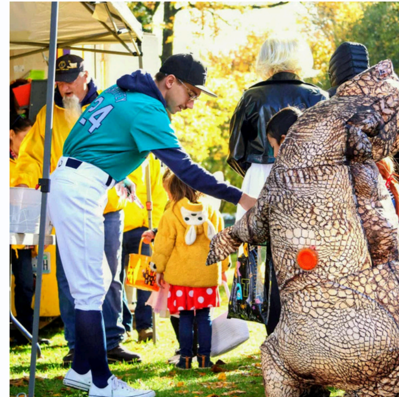
Trick or Treat Trail