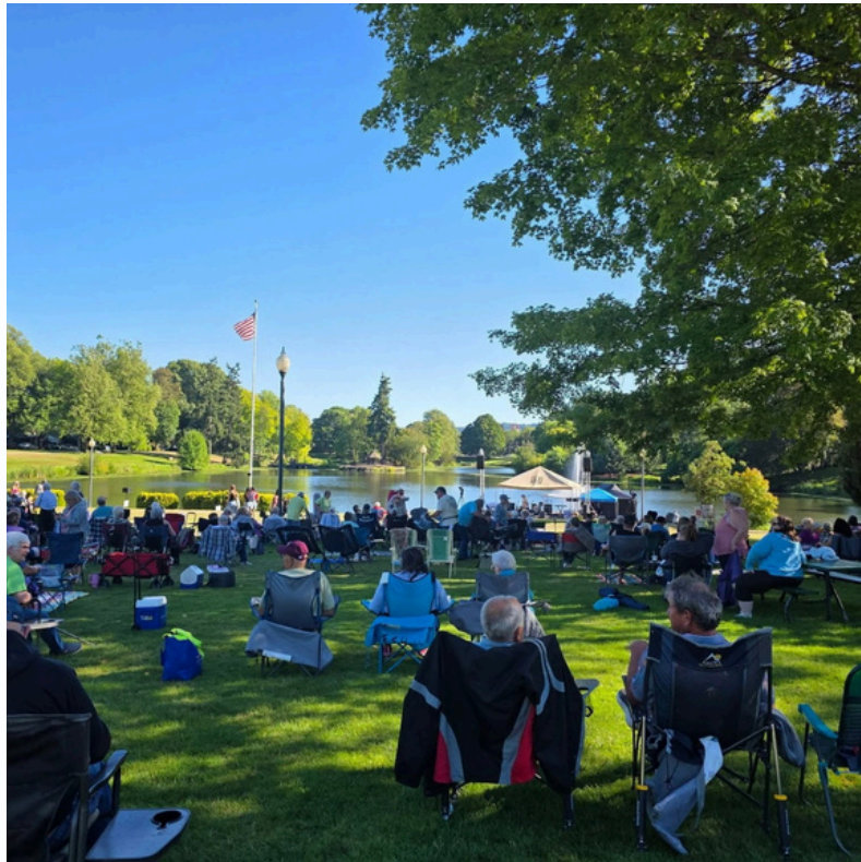
Concerts at the Lake