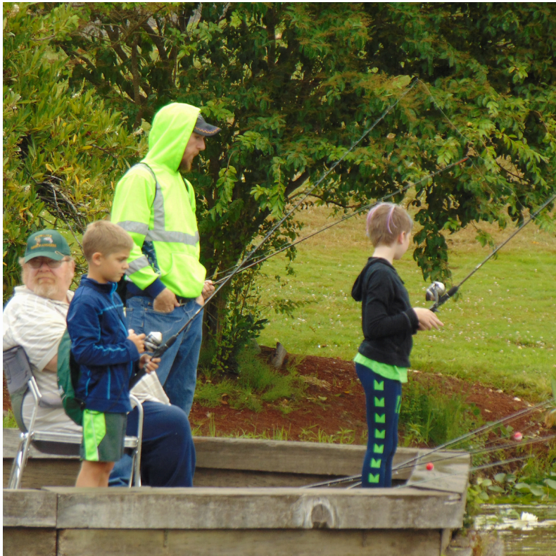
Kids Fish In Sponsored By: Rotary