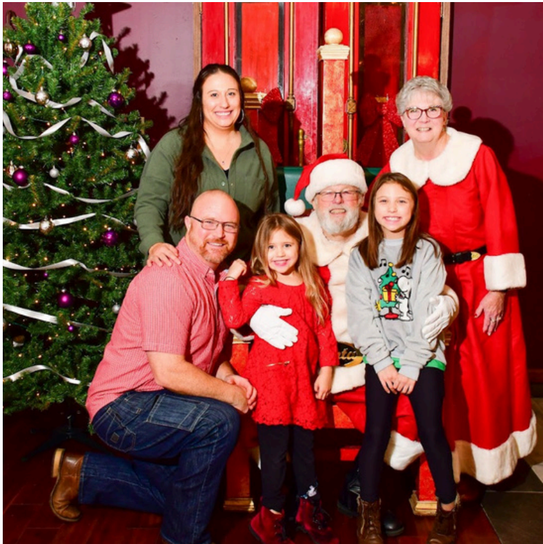
Breakfast with Santa