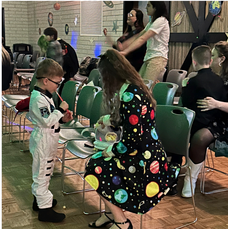
Mother Son Dance Party