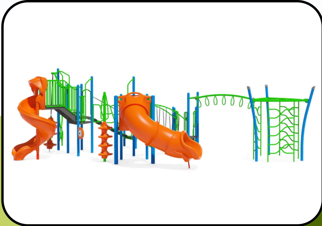
Similar Playset - $72,092 (pre-tax & shipping)