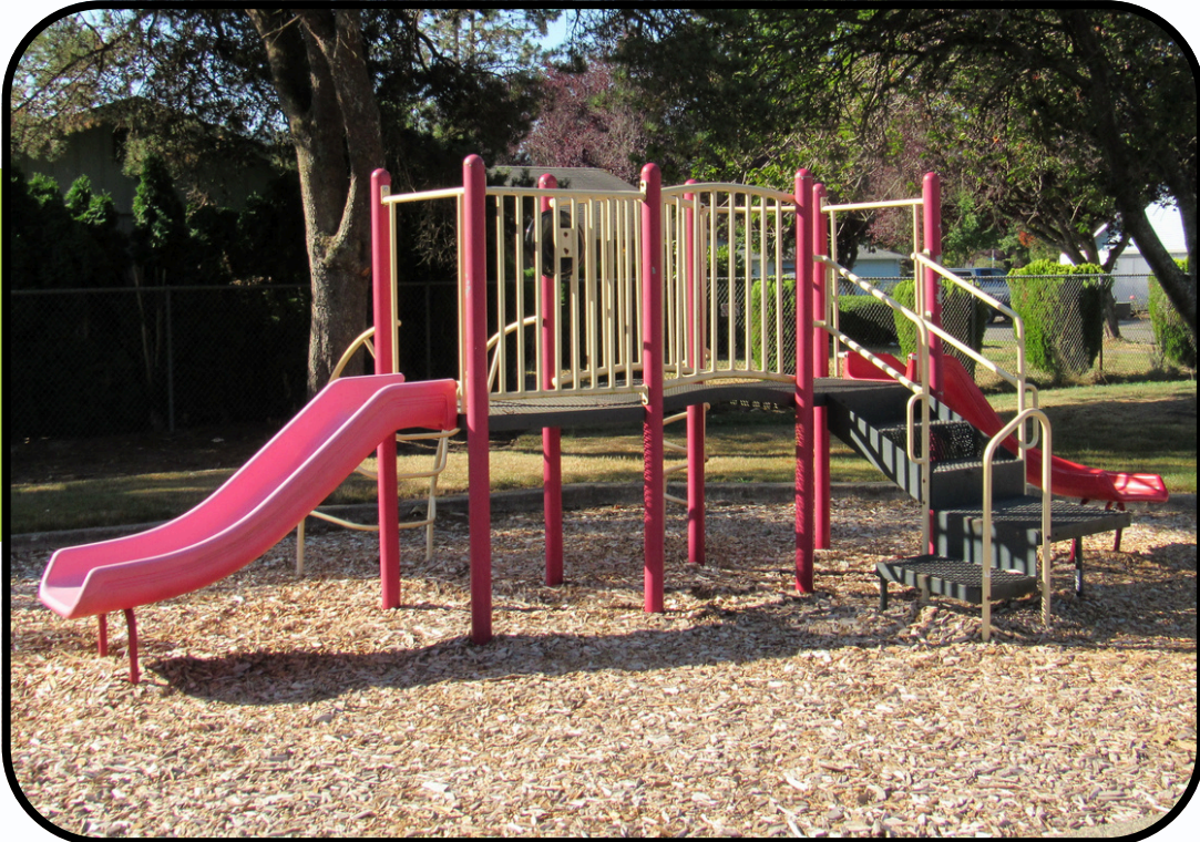
Previous Age 2-5 Playset