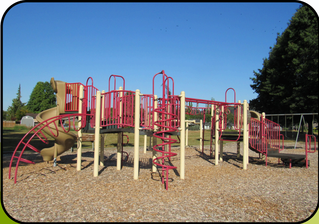
Previous 5-12 Playset