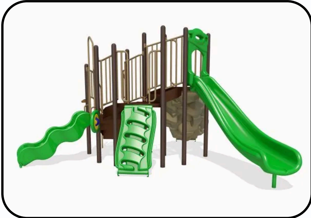
Similar Playset - $25,199 (pre-tax & shipping)