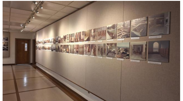
Completed Rotary Room for 100 th Anniversary. It is now another public meeting space for up to 30 people.